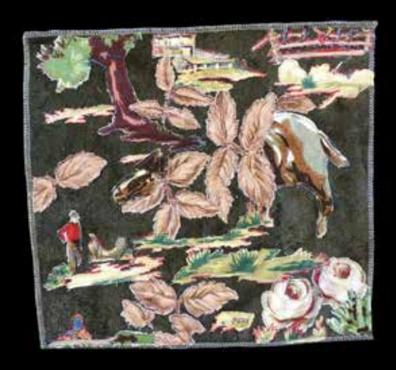
LANDSCAPE EAST / WEST 12x12 in., 12x12 in.