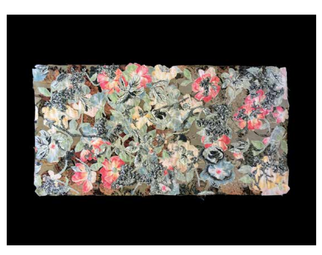
GARDEN WALL TUNNEL 20x33 in. 73x61 in.