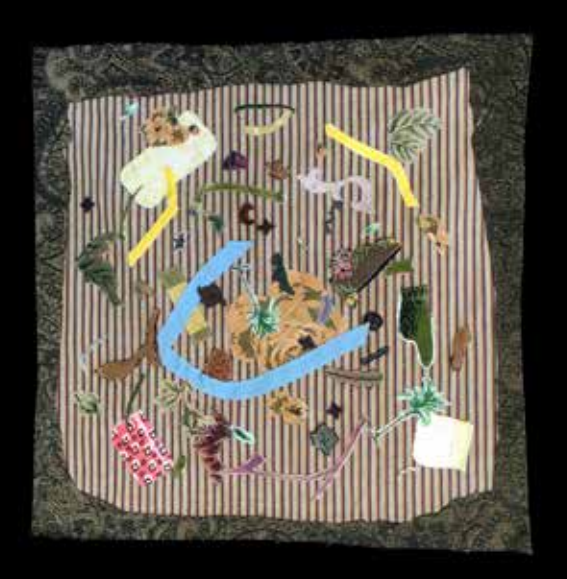
TRAIN WINDOWS 23x22 in., 22x21 in.