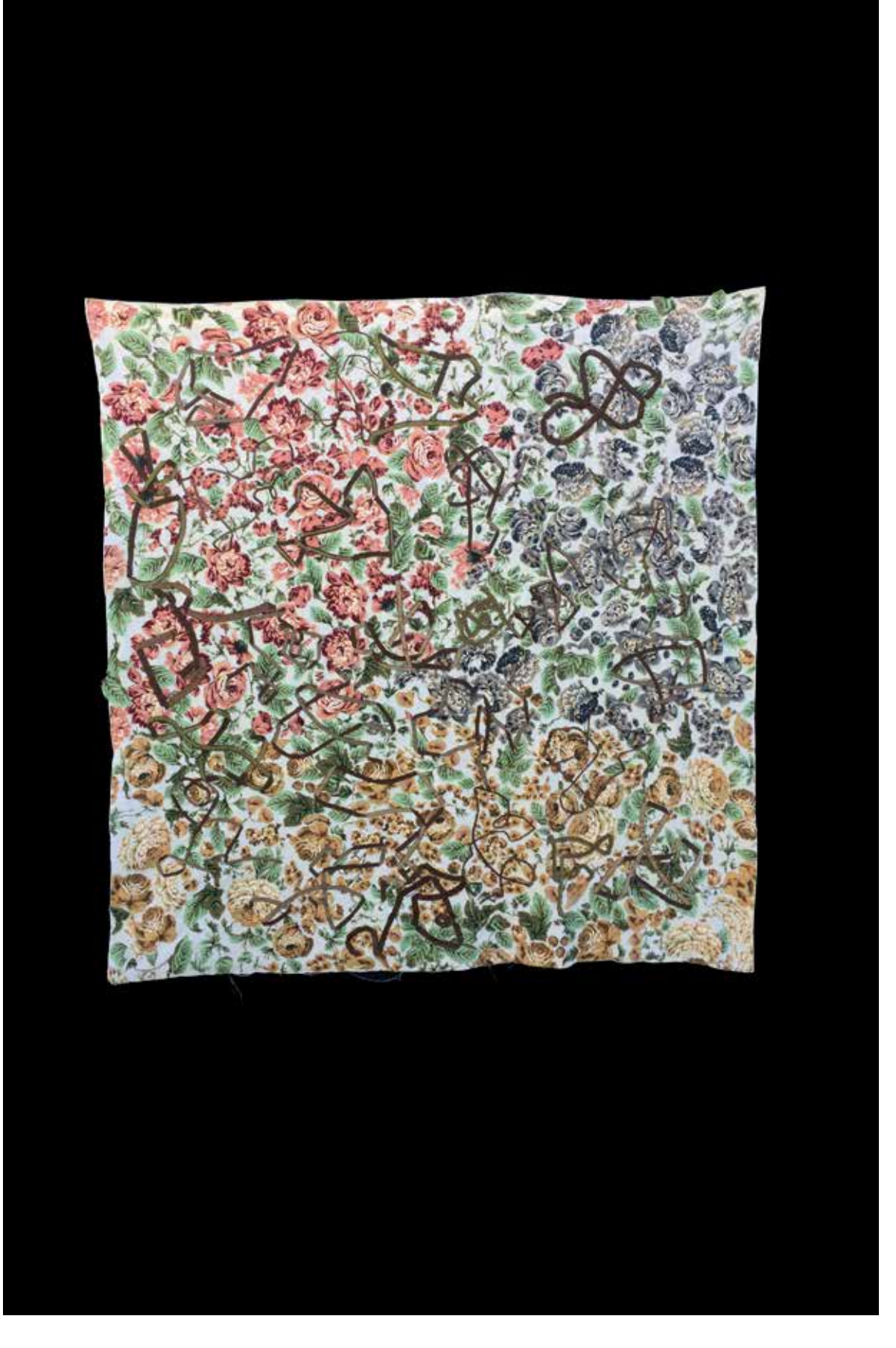
HORIZONISH FLOATING LINTS 44x49 in. 70x69 in.