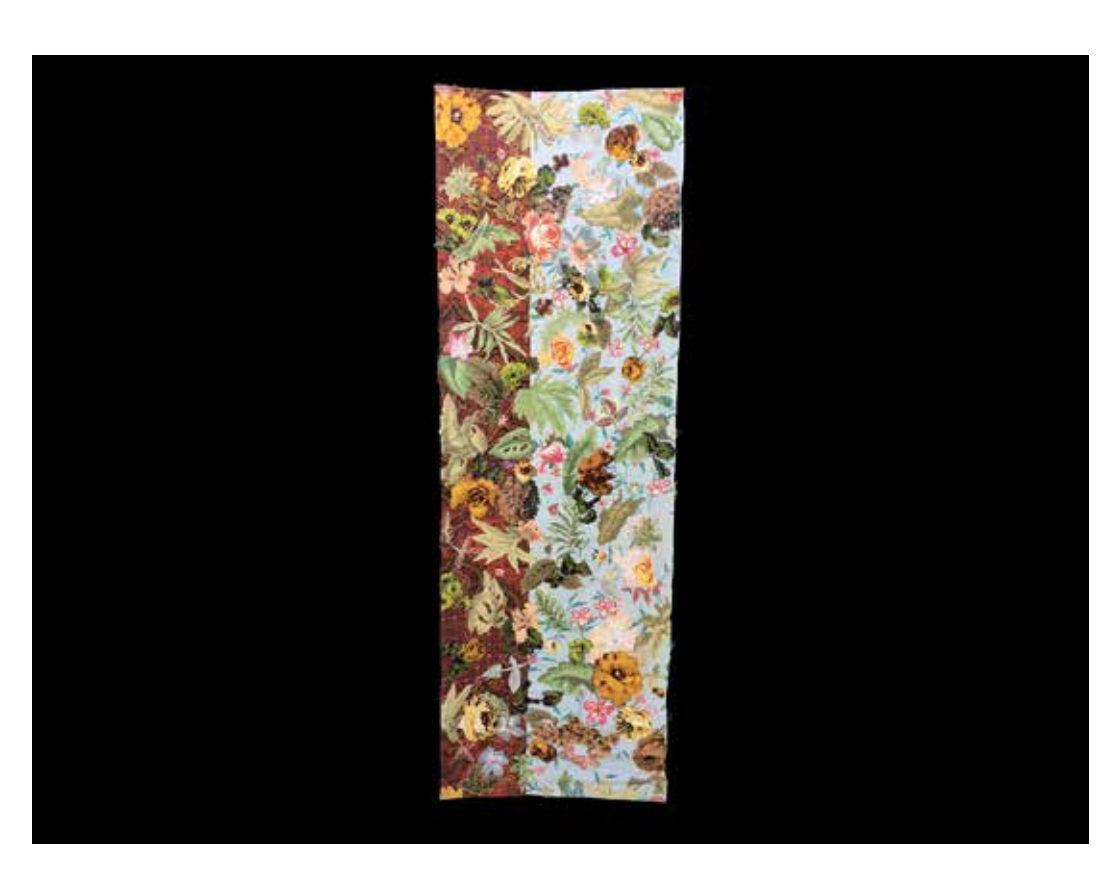
SIDEBAR 67x23 in.