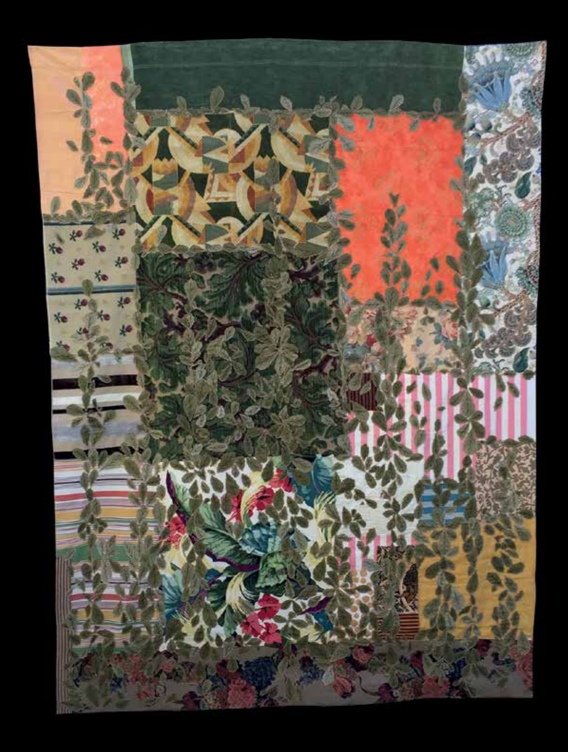
CREEPING IVY 83x63 in.